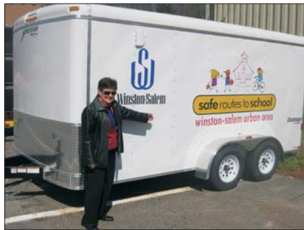
Safe Routes to School equipment trailer.