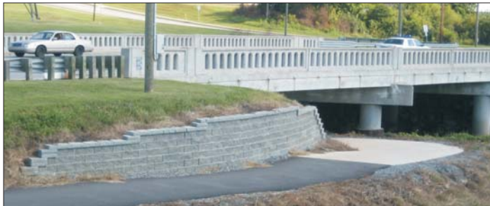
New Salem Creek Greenway underpasses mean there are no at-grade crossings from Marketplace Mall to Salem Lake.