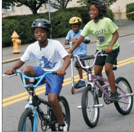
Having big fun at Cycling Sunday in June.

In addition, plans are underway for the installation of shared lane markings on Broad Street, from Salem Avenue to Cotton Street, and on Polo Road from Long Drive to Country Club Road. Parts of both roads will be resurfaced soon and existing pavement markings will be modified to accommodate cyclists and while helping to calm traffic in residential areas.