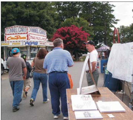
The MTIP on the road at Bowman Gray races.