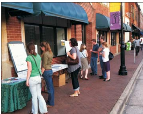
Meeting the public at the Gallery Hop in June.