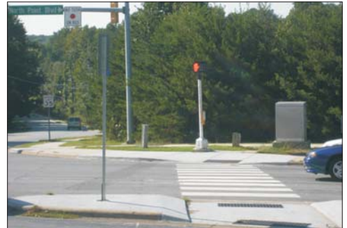
Crosswalk safety improvements at Bethabara Road and North Point Boulevard.

Improvements to the pedestrian environment on Cloverdale Avenue from Oakwood Drive to Melrose Street will soon be underway. These changes are the first part of a larger study conducted last year. Improvements will include realignments of inter-sections, new sidewalks, improved pedestrian crossings, and transit