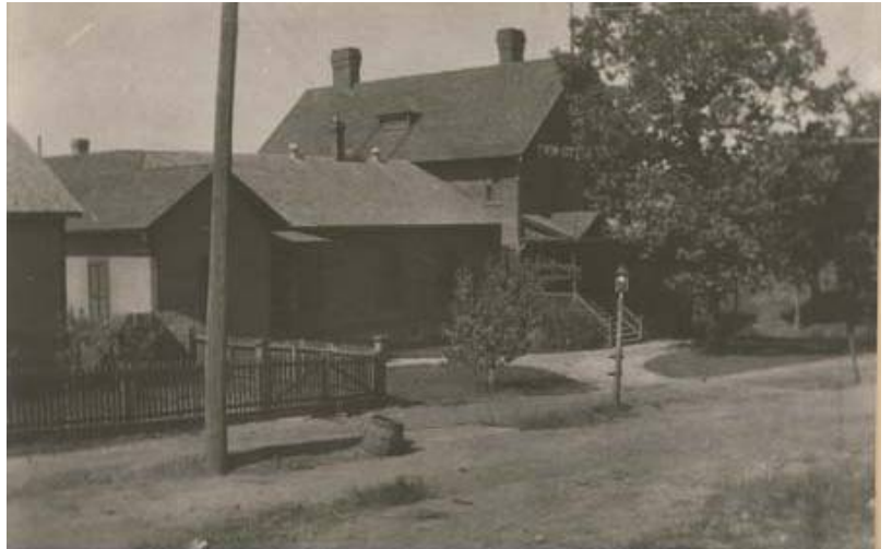
The Twin City Hospital was located on Brookstown Ave.

"It is also the opinion of this Board that the immense revenue derived by the Southern Railway Company from the business transacted at this point, entitles the Citizens of Winston-Salem to a large, convenient and comfortable Passenger Station." (6-473)