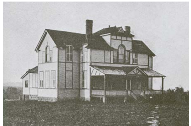
Slater Hospital was in Columbian Heights

March 3, 1904- The City Physician ..."advocated the purchase of a combination Police Patrol and Ambulance wagon. He was of the opinion that the Physicians would be glad to pay for the service of the ambulance instead of the hire of a carriage which they often did. The matter was referred to the Police Committee. (7-123)