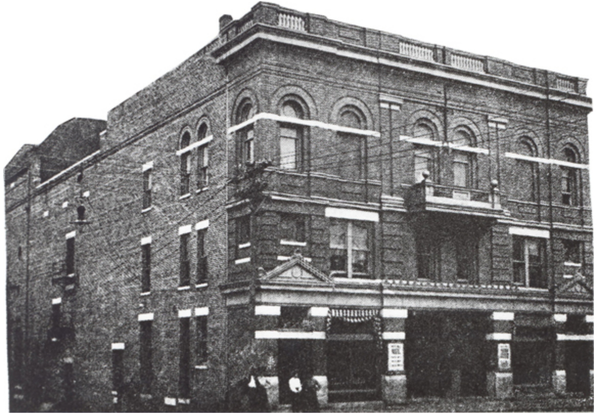
The Elks Auditorium, Winston's biggest venue for vaudeville acts opened in 1903 at the corner of 5 th and Liberty streets. It was also the location for school graduation exercises.

February 4, 1904-The Elks Auditorium on the corner of 5 th and Liberty streets was the first big concert hall in Winston when it opened in 1903. Its size and the number of people it could hold concerned the fire department. On this date, the Board enacted ordinances directly related to the structure include "That admission to the Auditorium shall be limited to seating capacity provided; That when necessary standing room on the first floor only may be permissible." No chairs were allowed in the aisles and management was to provide a man at every exit door. "It is further required of the management that extra caution is to be