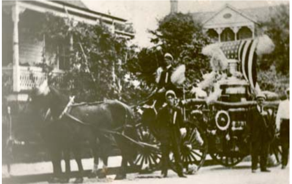
One of Winston's two fire pumpers decked out for a parade.