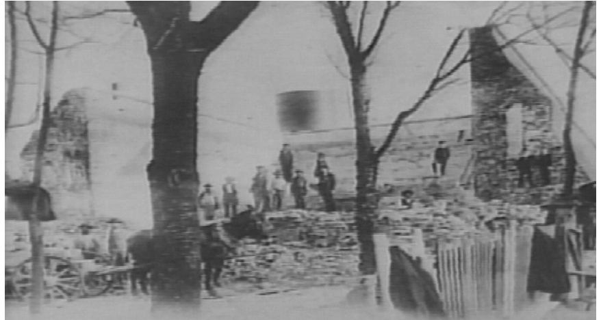
Spectators and workmen stand on the collapsed north wall of the reservoir.

The Mayor was authorized to detail Police Officers and all other employees of the City, with instructions to carry out the work and supply all necessary aid and assistance.