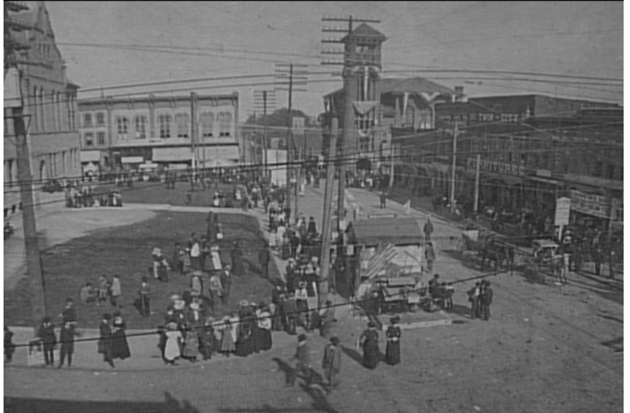
There were several streets fairs around Court House Square during this time. In this one, Main St. between 3 rd and 4 th is at right with the Winston Town Hall in the background.