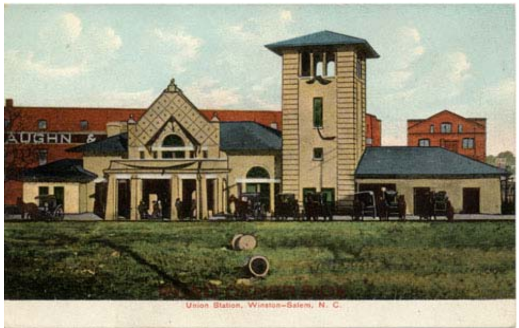
Union Station, Winston-Salem, N.C.

Oct 13, 1902-"Resolved by the Board of Aldermen of the City of Winston that a permanent easement be granted to the Southern Railway Company to a strip of land 15 by 200 feet, extending from Third to Fourth Streets, and being the Eastern portion of Chestnut Street, to be used for a proper approach to a new Passenger Station to be erected by the Southern Railway Company. It being understood that no part of the buildings of said company, shall be erected on said strip of land, but that the same shall be used said company for both proper street or sidewalk purposes and for a suitable approach, and it is further understood that the said Railway Company may shed said 15 feet of ground provided that no posts be placed beyond the curb line of said sidewalk." (7-23)