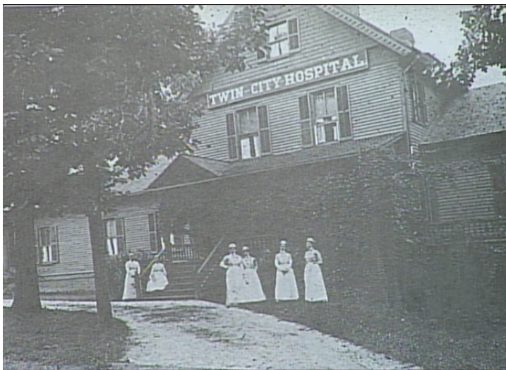
The Twin City Hospital was located on Brookstown Ave.