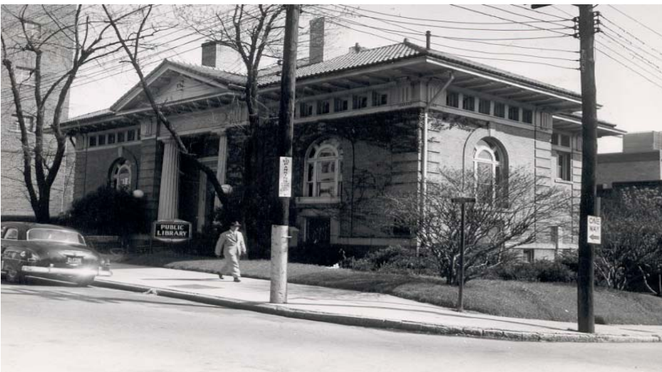
The Carnegie Library was conveniently located across the street from the Winston High School. This building is still in use as Our Lady of Fatima Catholic Church.