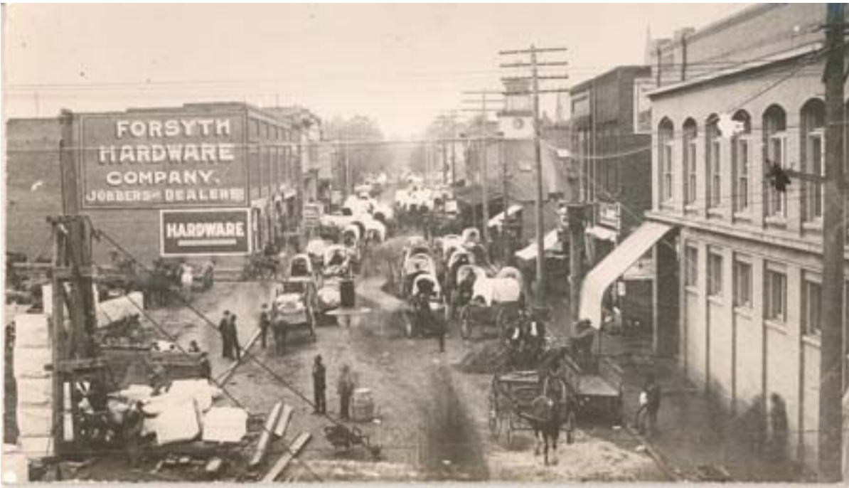
North Trade Street during Tobacco Market time about 1905.