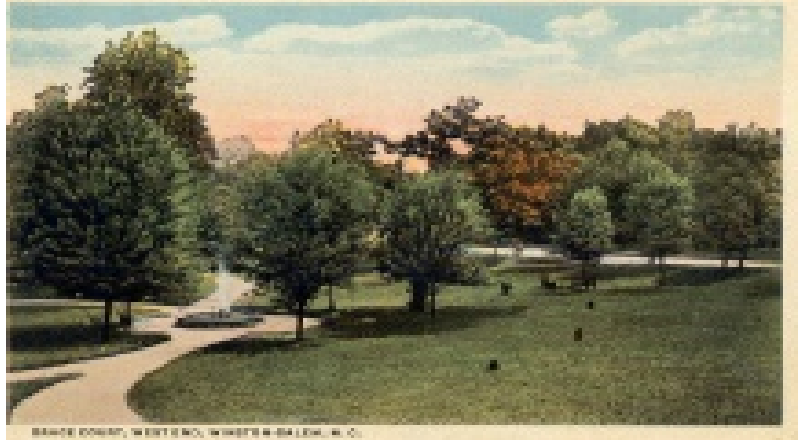
A postcard view of Grace Court Park. (Forsyth County Public Library Photo Collection)

Buxton came before the Board in April 1905 to officially make the gift. (7-190)