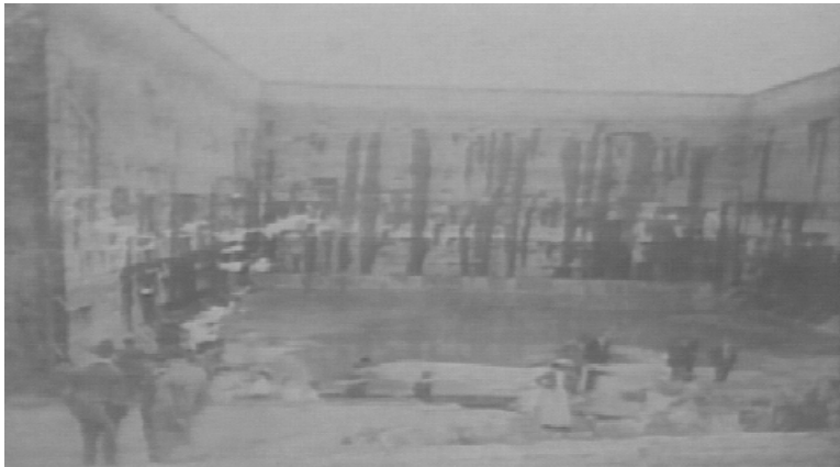
Spectators, including a woman in the center, stand inside the remains of the reservoir.

Mayor Eaton was authorized to look after the proper preparation and burial of all the dead.