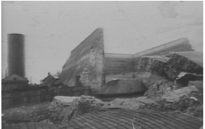
Photo showing the collapsed north wall of the reservoir. The standpipe at left was already being used as part of the town water supply.