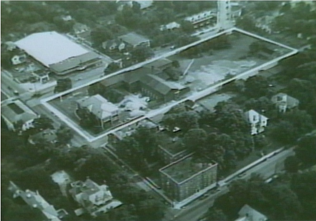
The West End School property sold in 1949 is outlined in this photograph looking south. Board St. is at left, 4 th St is the top line in front of the Modern Chevrolet building.