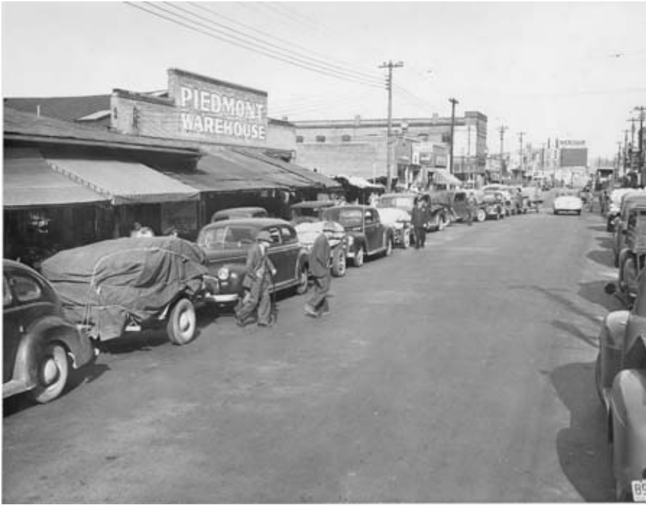
Trade Street in the 40's was a busy place during tobacco market time.