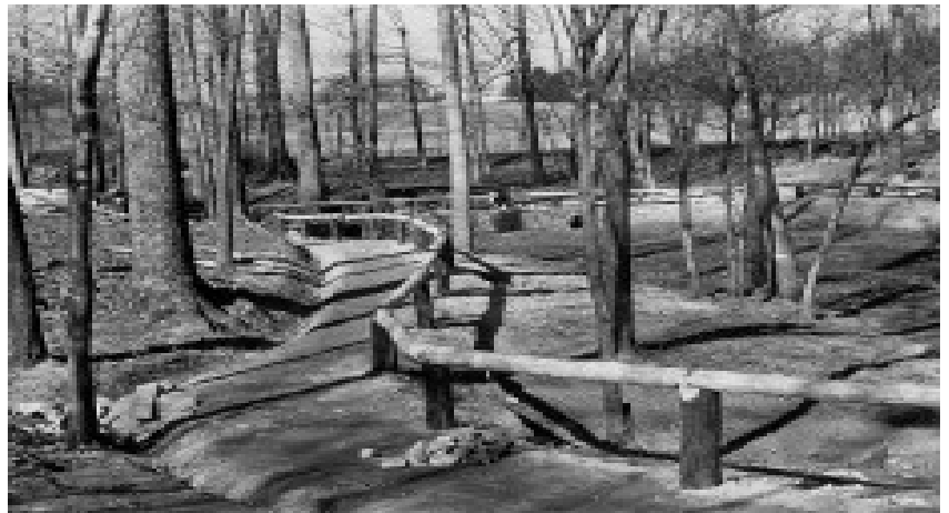
The trail in Miller Park.

March 28, 1941 - A report from the Heath Committee was received saying they had made a "...comprehensive study of the sanitary conditions prevailing in the City and has endeavored, among other things, to eliminate the cause of complaints concerning trash and unsanitary conditions, particularly in the downtown business area. (28-379)