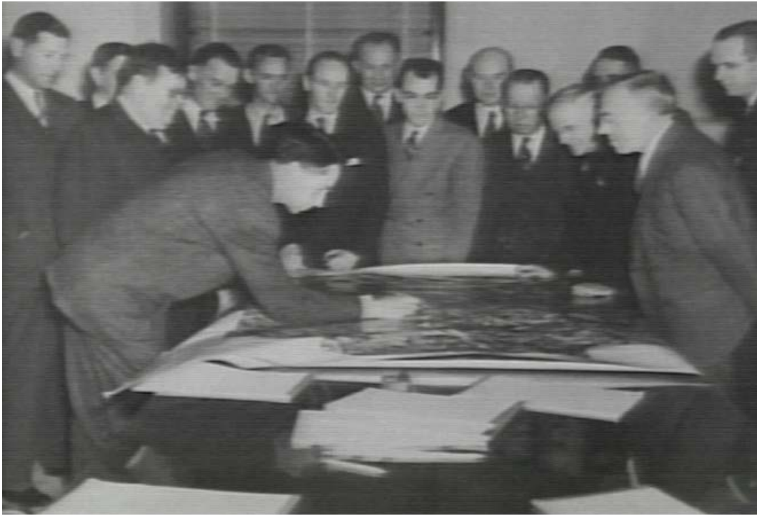
The Planning Board in 1948