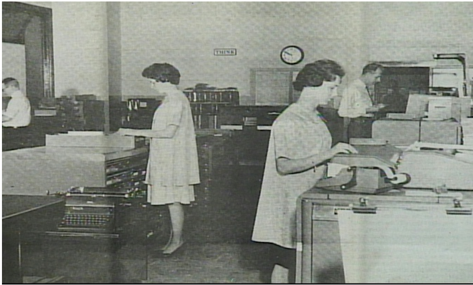
In 1949, the Water Billing Department began using a computer.