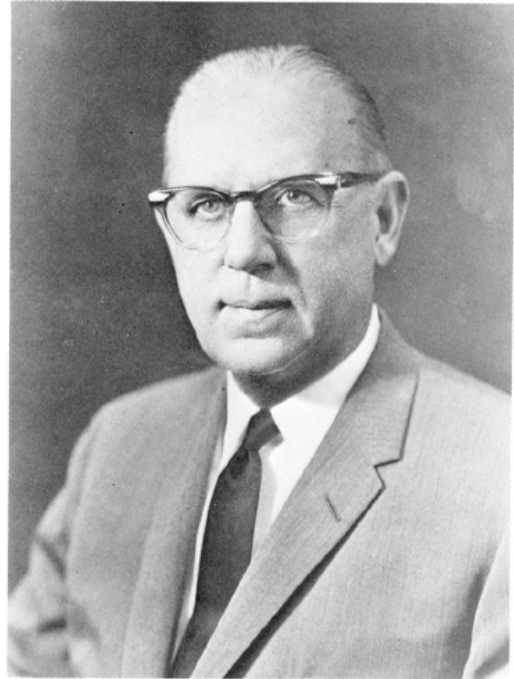
City Manager C. E. Perkins

At the December 7 meeting, the Board approved the paving with "Bituminous surface (tar) on 5 inch crushed stone base" at about $6.80 per frontage foot (33-630). During much of 1949, most meetings contain at least one request for paving action as homeowners were now able to afford paved streets.