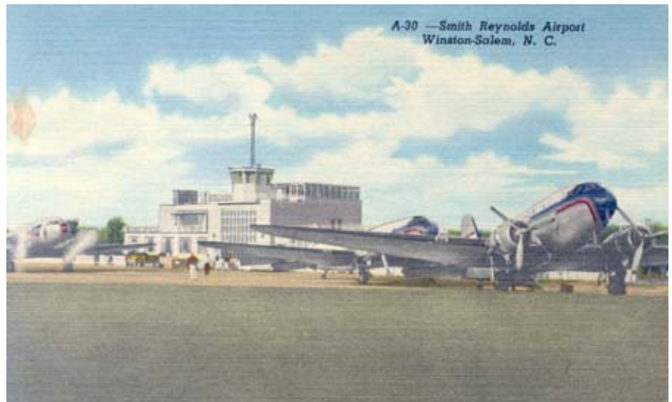
Miller Field was renamed Smith Reynolds Airport in 1942. This postcard dates from the early 1950’s.