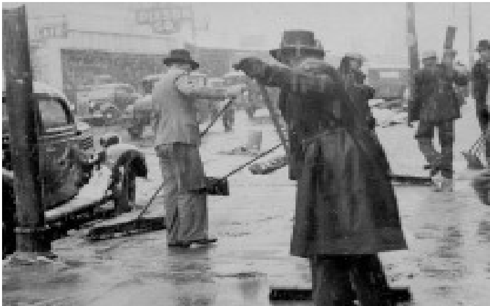
Merchants clear the sidewalks on 4 th Street after a snowfall about 1940.