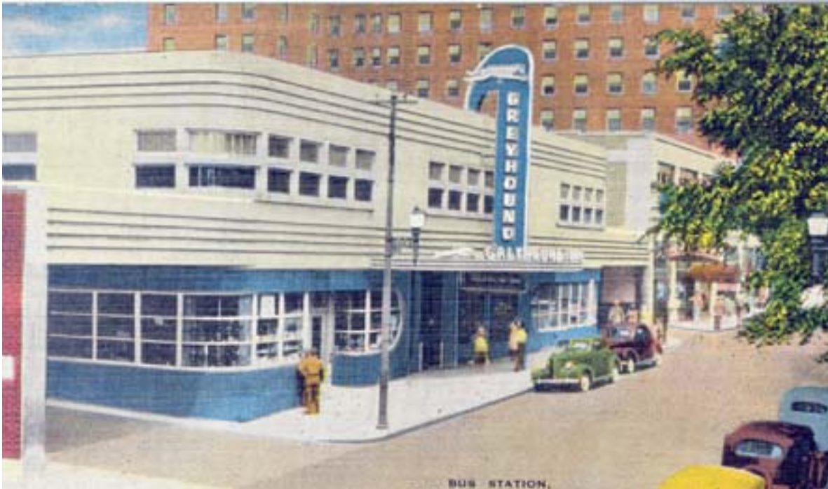
The Union Bus Terminal on Cherry between 4 th and 5 th opened in 1942. It was torn down to make way for a city parking deck in the 1970's.

May 8, 1942- Alderman Hensel suggested that the Traffic Committee consider the adoption of an ordinance regulating bicycle traffic, especially the use of bicycles by two simultaneous riders. (30-61)