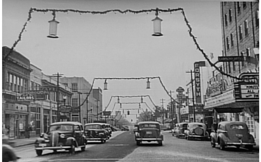
This picture of 4th St at Christmas in 1941 shows paved over street car tracks and no parking meters

The need for war materials had brought to a halt what neither the courts nor merchants could bring about. It was only temporary. Over 600 parking meters were purchased and installed in 1946. (32-323) There were 2 cent and 1 cent meters. A report on April 1, 1947 stated that the meters were averaging 331/3 cents per day per meter and”...in general they were working all right.” (32-568)