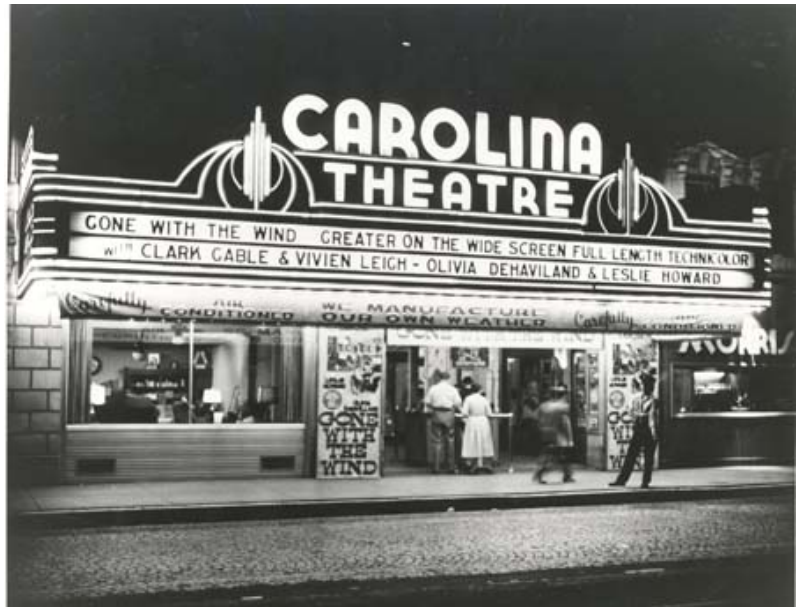
The Carolina Theater, now the Stevens Center, was the finest theater in the city at this time.