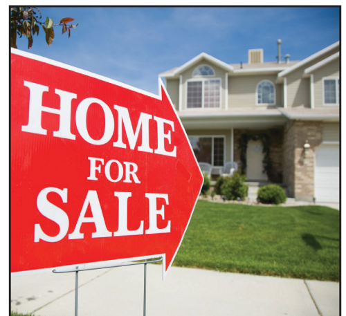
Real estate lead-in (directional) off-premises sign.