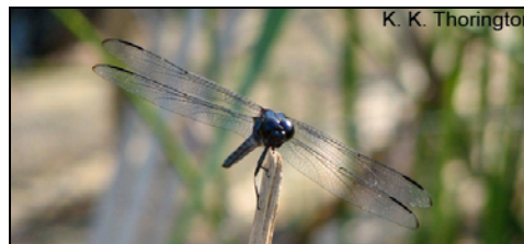
Slaty skimmer dragonfly

Many animals use marsh or other wetlands habitats for part or all of their life. Look for birds, mammals, reptiles, amphibians, insects and other invertebrates on your walk.