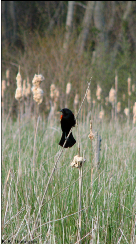
Red Winged Blackbird