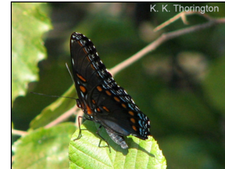
Red-spotted Purple Butterfly on Alder

Invertebrates: Many invertebrates (insects, spiders, crayfish, snails and others) make their homes in the wetlands. They are food for marsh birds, mammals reptiles and amphibians. Crayfish are a particular favorite of raccoons, who leave the shells behind. Butterflies use many of the marsh plants for food. Swamp milkweed provides food for monarch caterpillars and button bush flowers attract many butterfly species.