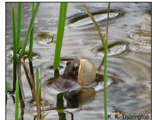
Chorus Frog (3/4 inch long)

Frogs The marsh is home to many frogs including spring peepers, southern chorus frogs, green frogs and bullfrogs. The chorus of spring peepers and southern chorus frog is often deafening in early spring when breeding season begins.