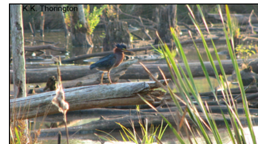
Decaying logs and Green Heron

What you see in the marsh is a pattern of succession and decay that is fairly typical of wetlands created by environmental disturbance, either human or non-human, in the Piedmont. Since 18 th century Moravian settlement, the land that is now the marsh has been wetland, farmland and bottomland forest. With the widening of Reynolda Road in the mid 1970s small streams were blocked. Rising water and beaver activity killed the mature trees, leaving standing dead wood, which is good for woodpeckers and marsh birds. More recently these dead trees have fallen, making room for other marsh species. Trees and other plants, including cattails, that like their feet wet now dominate the area. Insects, turtles and snakes often sun themselves on dead logs. Herons and hawks can be seen hunting in the wetland.